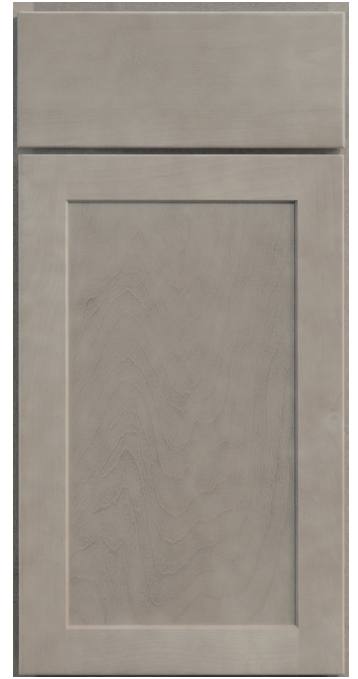
Full Overlay / Steel Grey Birch