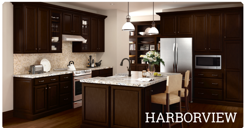
Partial Overlay / Twilight Birch