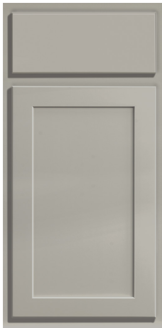
Partial Overlay / Pecan Birch and Shale Paint