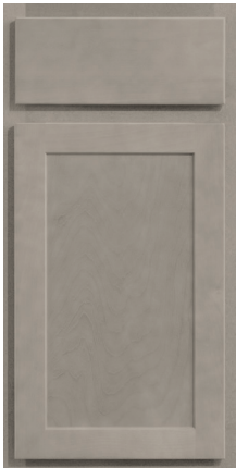
Steel Grey Stain