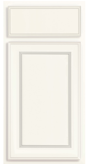
Partial Overlay / Cotton Paint