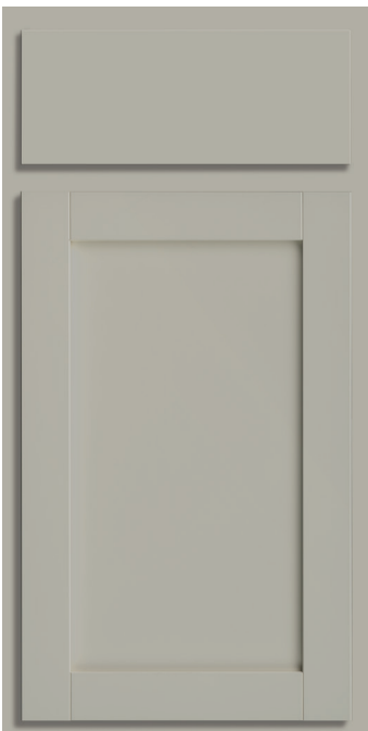
Partial Overlay / Grey Laminate