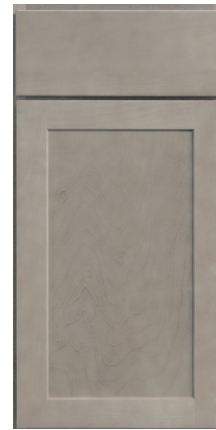
Steel Grey Stain